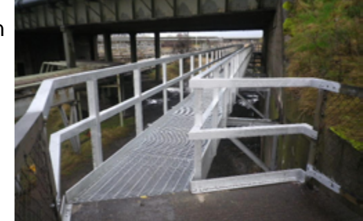
Wilton Steel Works - new Tata Steel Bridge on Teesdale Way in Redcar and Cleveland

Two major projects have been completed within Redcar and Cleveland Borough; the steel footbridge at the Wilton Steel Works (costing £100K) crossing the main east coast railway line safely, and could not have been achieved without considerable financial assistance from the Coastal Communities Fund and Tata Steel. This is an example