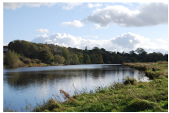
River Tees in Darlington Borough