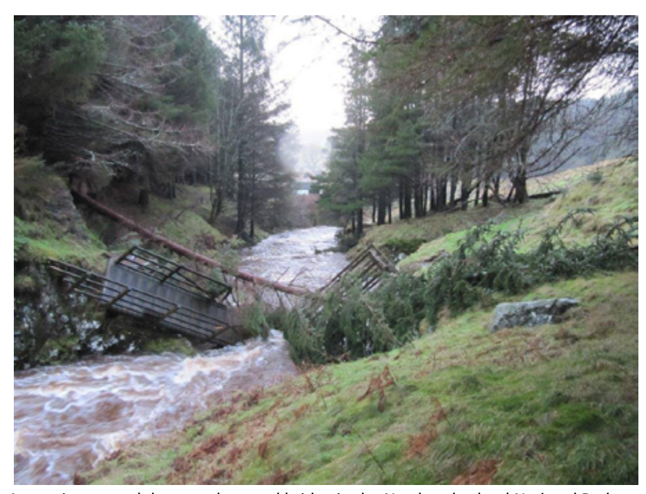
Access interupted due to a damaged bridge in the Northumberland National Park

The cost of repair of this winter's destruction is estimated to be almost half a million pounds, far exceeding budgets the Council and the National Park set aside for dealing with their existing (and long) list of paths needing maintenance. The loss of local amenity is bad enough but the economies of these northern rural counties depend on tourism, and access to the countryside is, fundamentally, why the tourists come.