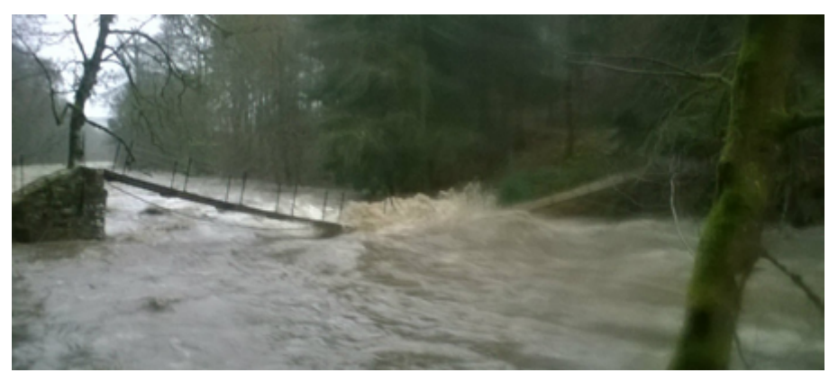
Allen banks bridge damaged in the flooding

significant damage; over 34 rights of way are at best interrupted and at worst impassable.