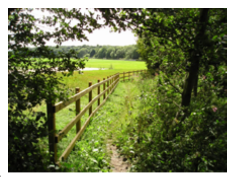
Middlesbrough FC training ground

The River Tees Rediscovered programme runs over 5 years. A diverse range of projects is being delivered, including schemes which will conserve and enhance natural environment and heritage features, improve public access to nature and heritage, celebrate