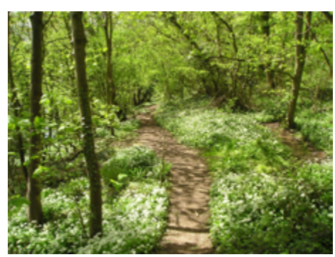
Re-surfacing work in Darlington Borough on the Teesdale Way

and interpret the area's heritage, and provide opportunities for people to get actively involved.